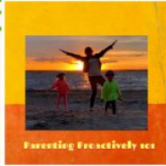
Parenting Proactively 101