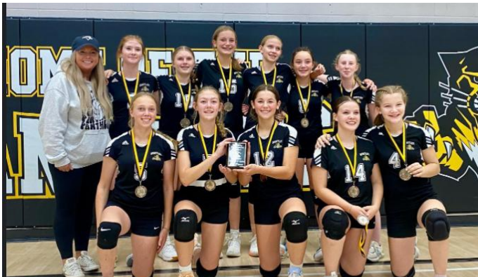
Jr. A girls win bronze at their home tournament Sept 14