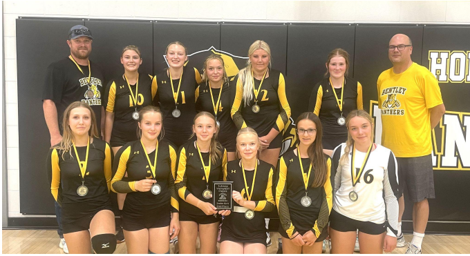
Senior High girls win silver at their home tournament, Sept 7