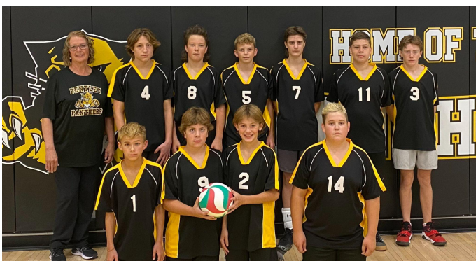
Jr. A boys placed fourth at their home tournament Sept 28