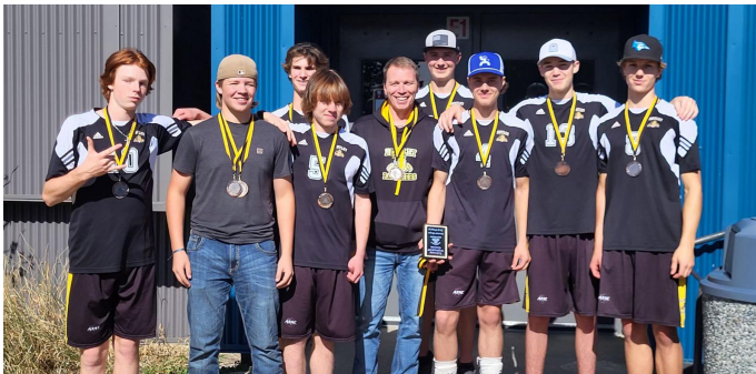
Senior High boys win bronze at their home tournament after a power outage delay, Sept 21