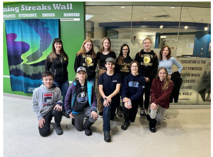
Congratulations to our Bentley Panthers SchoolReach intermediate team for winning gold and to our jr. teams for placing second and fourth at the regional tournament on Sat, March 4 in Ponoka. Good luck to our intermediate team and both jr. teams as they compete in provincials on April 29