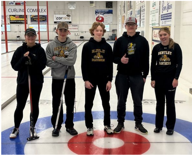
Sr High Mixed Curling team wins silver in both the areas & zones bonspiels!