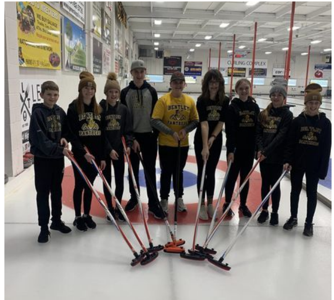
Jr. High Curling Team