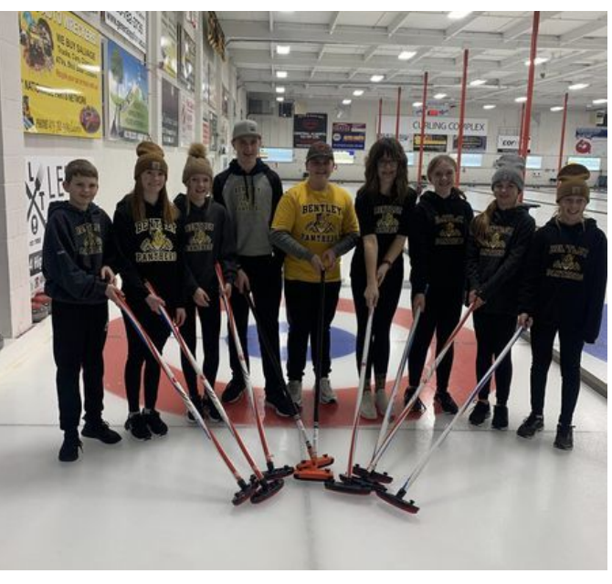
Jr. High Curling Team