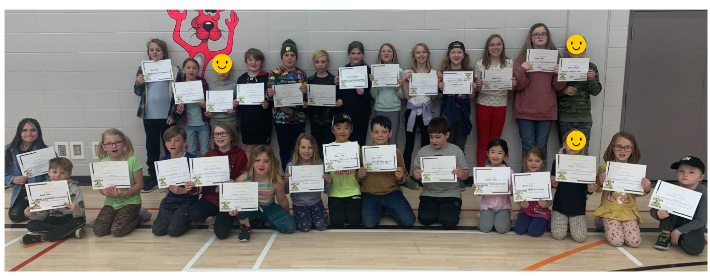
Congratulations to our May student of the month winners!